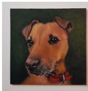
Terrier 6 by 6 inches