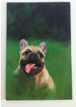
Frenchie 5 by 7 inches