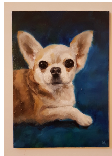
Chihuahua 5 by 7 inches