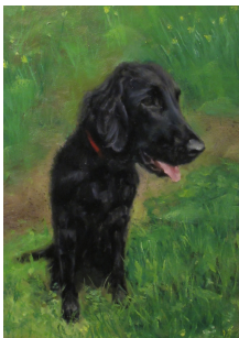
Spaniel 5 by 7 inches